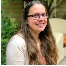
Meet the Expert