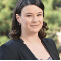
Meet the Expert