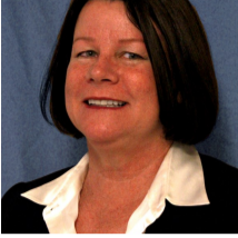
Meet the Expert